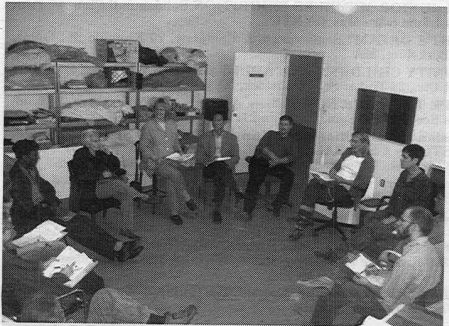
Meeting of artists at YoHo Artists Studios, Yonkers, NY, working out the logistics for the upcoming Annual Open Studios May 17 & 18

different members of the press and letting them know first hand what works and doesn't work in getting our attention. From the early 1900's until the 1950's the building was the Alexander Smith Carpet Factory (where over 5000 people worked) and then it was converted into different businesses. For the past 15 years the 5th floor has been an Artist Colony. When I spoke with individual