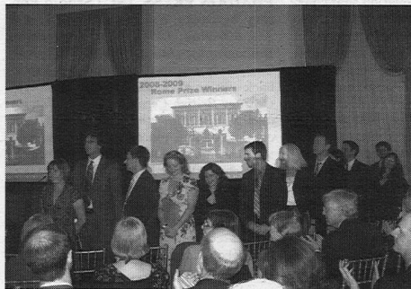
Some of the Awardees at the Rome Prize Ceremony of the American Academy in Rome

I stopped to see the 141st International Exhibition of the American Watercolor Society at the Salmagundi Club , 47 Fifth Avenue, NYC and what a fabulous show. I walked around looking at the 100 + paintings, amazed at how so much variety of style could come from pigment, paper and a brush. This was truly a fabulous show. No wonder busloads of artists from the