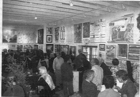
The opening reception at Kleinert James Art Center's members' show.

and decided to make changes. The members fought to end discrimination against women artists and now the focus is to networking, career educa-